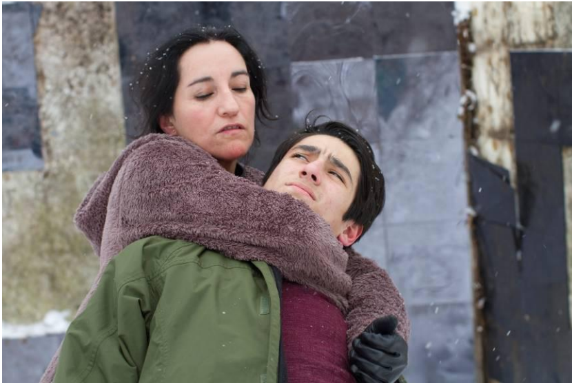
Dana Hoey, detail from Demonstration 1 , archival pigment print, 2013.

Photographer Dana Hoey's fascination with aggression—especially female aggression—has led to her new series of photographs, “Love Your Enemy,” which examine fighting as an inevitable human activity. In order to construct the series, Hoey engaged a choreographer to demonstrate different methods of attack and response, and hired skilled master fighters to play out the dramatization since, as Hoey remarked, “I never see what I want to photograph, so I set it up.” The resulting pictures, shown as grids, like the motion study photographs of Eadweard Muybridge, evoke “How to” manuals and analog contact sheets. The different grid series present avenues for speculation and narration, opportunities for the viewer to become the storyteller as they follow through the frames of photographs. Hoey has also included still portraits and details from the fight scenes that show the more emotional side of conflict.