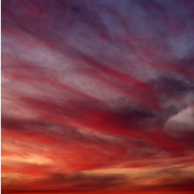
Carolyn Marks Blackwood, from Cloud series, archival pigment print, 2013.

Carolyn Marks Blackwood views the Hudson River from a house on a 120 foot cliff. From that elevated position, she documents the passage of time by photographing the ever-changing seasons, weather and light. When she sees the clouds, she sees abstract paintings. When she looks at water she sees patterns and textures. When she sees the ice breaking in the river's tide she sees a kind of geometry; golden edges, color and light- a kind of cubism. The photographs in this exhibition, The Elements of Place , are a study of one place, and its many manifestations.