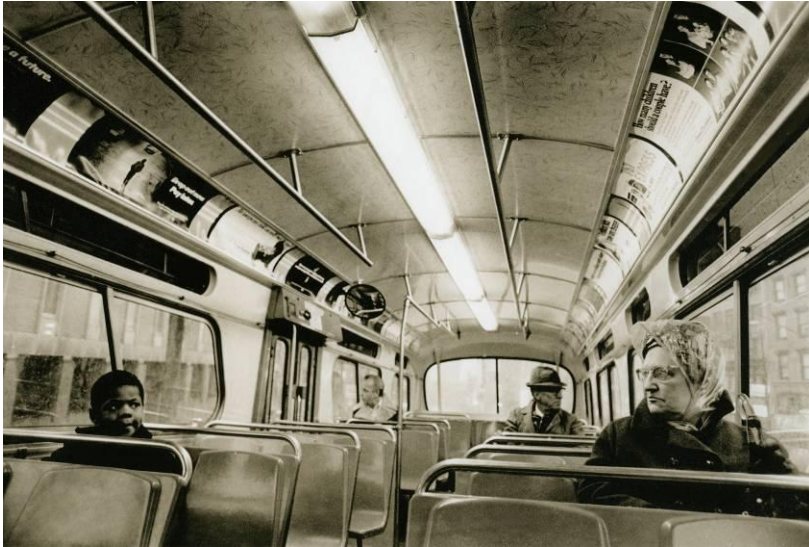
Martin Benjamin, Albany Bus , silver print, 1974.

The photographs selected by Martin Benjamin represent several periods in his artistic career, from the documentary images of his American Road Trips series shot during the early 1970s to the more recent color diptychs of Vietnam and Italy that allows Benjamin to pair images and show “uniformity within diversity.”